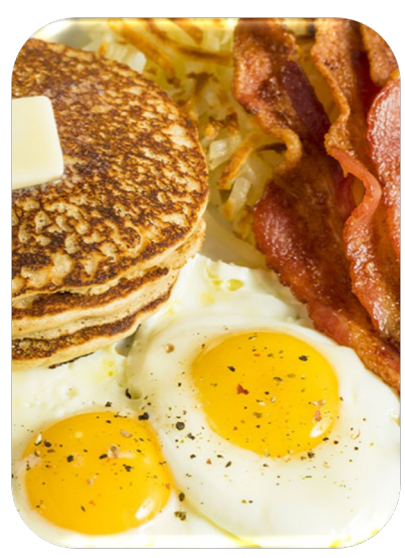
The Pro's Plate

Eggs Your Way 🝳 – Sunny Side Up, Over Easy, Over Medium, Over Hard, or Scrambled